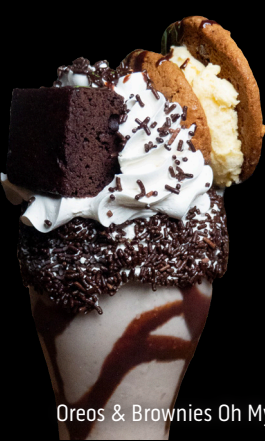
Oreos & Brownies Oh My