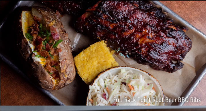
Full Rack Point Root Beer BBQ Ribs

HOT HONEY BBQ SALMON 24 8 oz. Salmon, WBP BBQ spice blend, hot honey, side of your choice