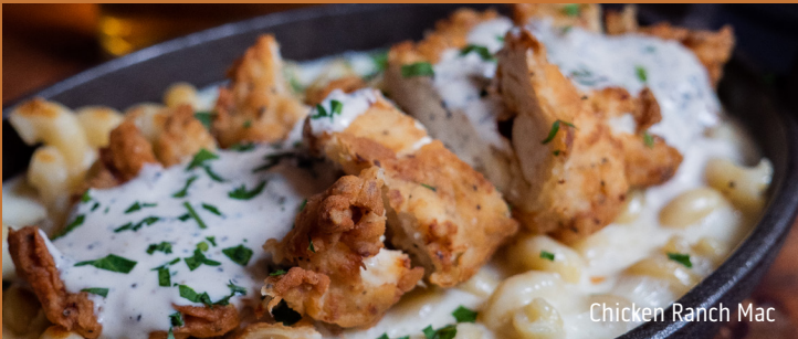
Chicken Ranch Mac

CHICKEN PARM 16 House marinara, hand dipped crispy chicken, provolone cheese