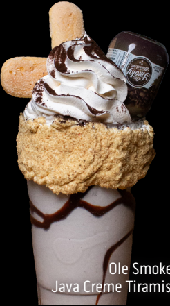
Ole Smokey Java Creme Tiramisu