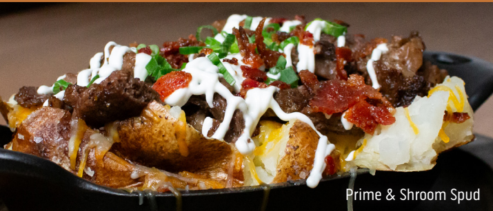
Prime & Shroom Spud

While we do our best to accommodate all our guests, please note that we are not a nut/gluten-free facility, and cross-contamination may occur. For clarification or specific allergen information, please let us know prior to ordering. *Consuming raw or undercooked meats, poultry, seafood, shellfish, or eggs may increase your risk of foodborne illness, especially if you have certain medical conditions.