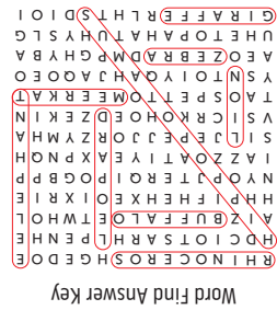
Word Find Answer Key